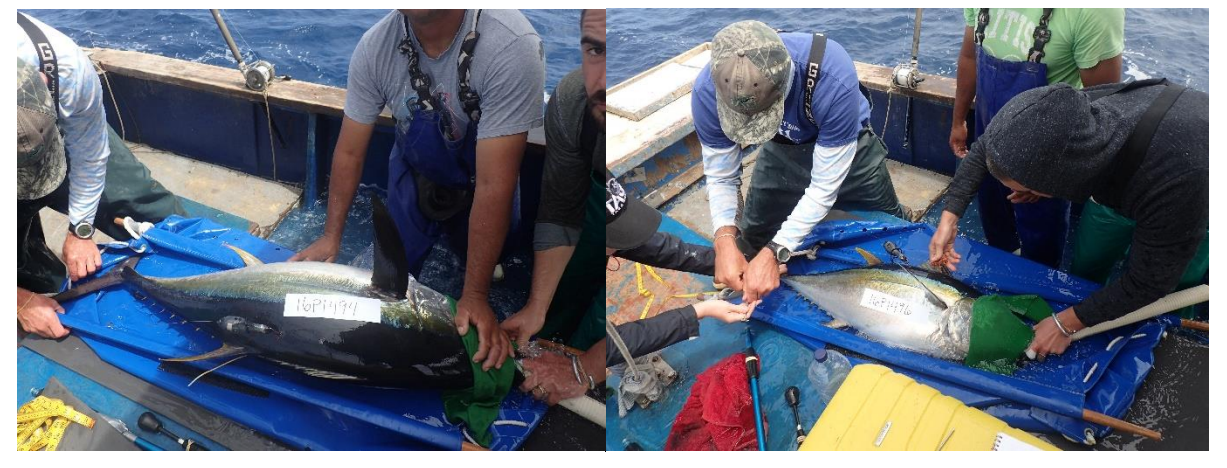
Pictures above: Stanford University team successfully deploying satellite tags and collecting tissue samples of yellowfin tuna.

Tuna tagging has been extremely successful. To date 733 tuna had been successfully tagged we have had 93 tags returned by local fisherman. The Stanford University team arrived in September 2016 and successfully undertook satellite tagging of 12 tuna and the collection of tissue samples for isotope analysis. (Please see interim report at Annex 5)